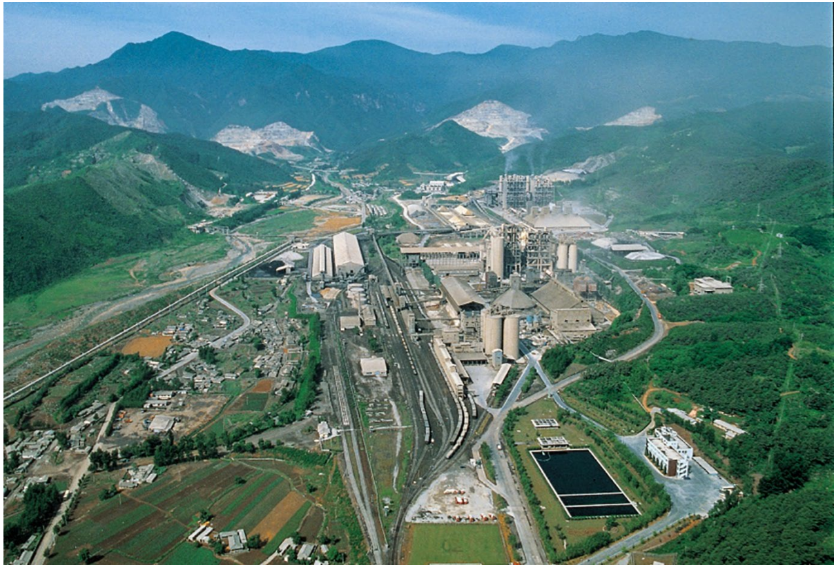
Ssangyong Cement Donghae plant

Ssangyong Cement wanted to increase alternative fuels (AF) use at its Donghae and Yeongwol cement plants. They were interested in using the HOTDISC® reactor, but it didn't fit within their existing SLC calciner layouts and a conversion to an ILC calciner to increase AF firing was not economically or technically feasible. They challenged us to redesign the HOTDISC reactor to suit an SLC calciner system.