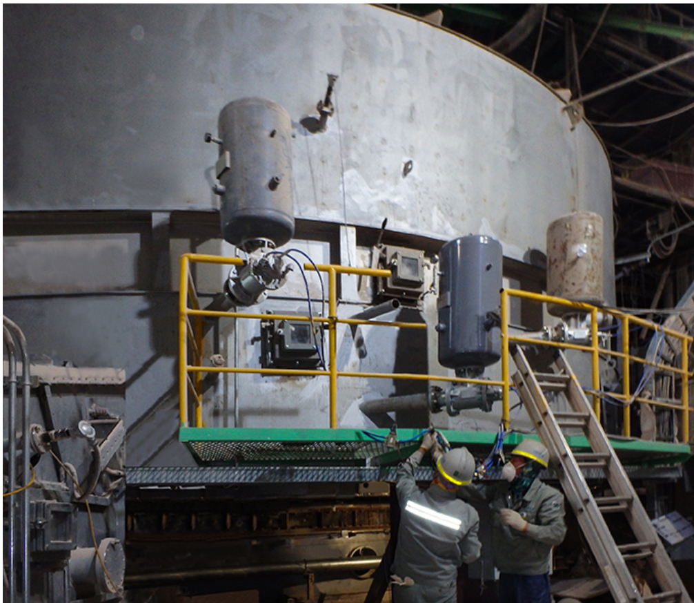
One of the HOTDISC-S reactors installed by Ssangyong

The actual results have surpassed expectations. The guarantee of 85% waste fuel