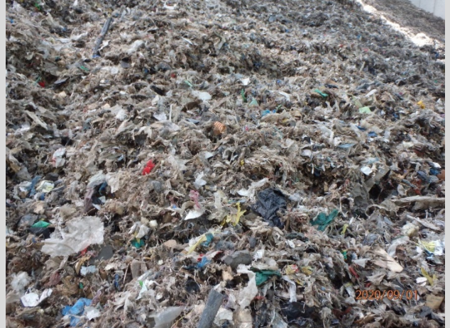
Solid recovered fuel

The Ssangyong Cement plants are utilising Solid Recovered Fuel (SRF), which has been pre-sorted prior to receipt at the plant, ensuring they get good quality fuels with very low moisture content.