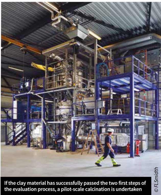
If the clay material has successfully passed the two first steps of the evaluation process, a pilot-scale calcination is undertaken

“Step 3 is the time to experiment with process design, to define the optimum parameters for calcination, colour control and emissions,” says Mr Franklin.