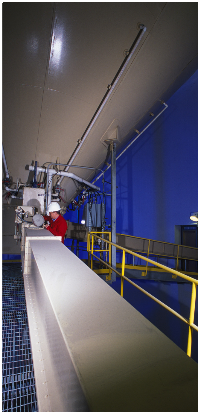
Airslide® gravity conveyor